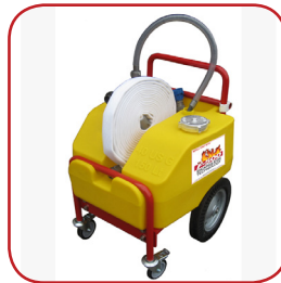
F-500 EA 26 or 40-gallon Portable Carts