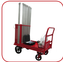
F-500 EA Piercing Rods for Deep-seated Fires