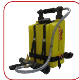
F-500 EA Handy Pack for Rapid Deployment