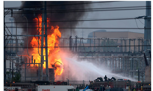
ConEdison monitors FDNY progress at transformer fire.

After this incident, ConEdison began extensive testing of agents on energized transformers. Ultimately, they learned F-500 EA was the only agent capable of being applied to an energized transformer up to 345,000 volts with imperceptible electrical feedback to the nozzle.