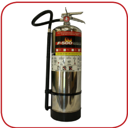
F-500 EA 2.5-gallon Fire Extinguishers

As an encapsulator agent, F-500 EA, mixed with water reduces the surface tension of the water, giving F-500 EA the ability to penetrate up to 15 feet into the coal. Beyond that, in the case of a deep-seated silo or stockpile fire, a piercing rod can be used to deliver the F-500 EA to a targeted area. Secondly, F-500 EA encapsulates the coal dust that is stirred up, preventing flare-ups. Finally, F-500 EA rapidly cools the fuel and surrounding surfaces. If you remove the heat, you remove the fire.