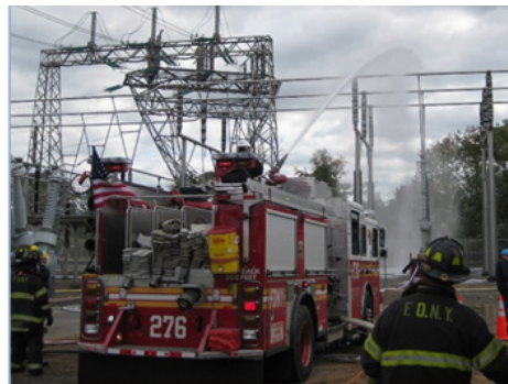
FDNY assist ConEdison testing F-500 EA applied to a 345,000 volt transformer.

Like turbines, transformers are a three-dimensional fire with extreme heat and Class B oil. F-500 EA is exceptional at extinguishing these fires by encapsulating the oil, cooling the oil and transformer and quickly reducing the black smoke. Also, after the ConEdison testing, we learned F-500 EA can be applied as soon as firefighters arrive on scene, streaming from 125 feet. There's no need to wait hours for the power to be turned off.