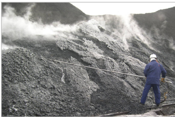
Extinguishing coal stockpile with F-500 EA Piercing Rod

To reduce emissions, the last decade has shown a trend towards sub-bituminous coals. These coals are volatile and rapidly oxidize, frequently resulting in spontaneous combustion. Dealing with these fires has proven to be challenging and dangerous. Foam forms a blanket on the coal, but there is enough oxygen in a pile of coal to sustain the fire. Water stirs up the combustible coal dust, causing dangerous flare-ups. In confined spaces, the flare-ups can lead to explosions.