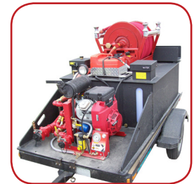
F-500 EA Rapid Response Trailers

F-500 Encapsulator Agent has proven to be indispensable around the coal handling system. A well equipped power plant will have F-500 EA fire extinguishers, piercing rods, portable carts, Handy Packs and even F-500 EA Rapid Response Trailers at-the-ready for any coal handling event.