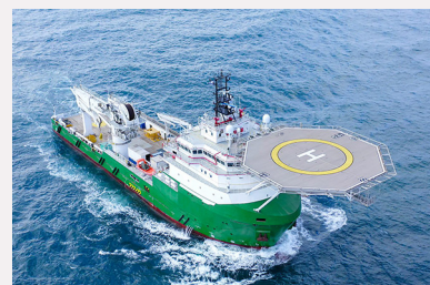
Marine - Offshore