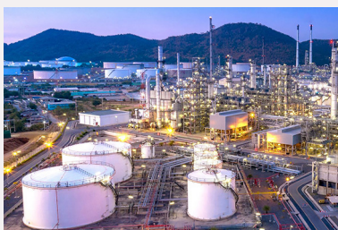
Industrial - Sprinkler