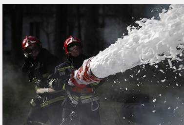
Fire Brigades - Fire Trucks