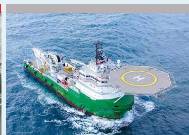
Marine - Offshore