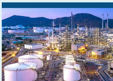
Industrial - Sprinkler

Economical and environmentally beneficial testing with optional Dosing/Return valve (DRV) and two separate flow meters.