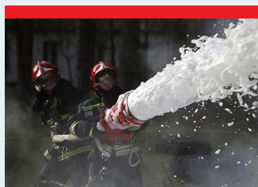
Fire brigades - Fire trucks